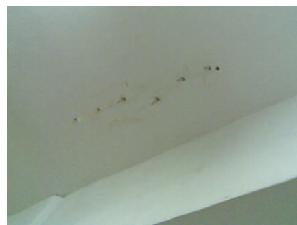
4. Curing and patching.