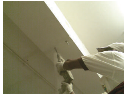
1. Drill injection holes.

Clean the injection pump, mixers and any other tools that come in contact with the product thoroughly using PENTENS SO3 or a solvent. The packers can be removed within 24 hours and the holes should be patched. If desired, an electric grinder can be used to remove excess cured grout that flew out from the cracks.