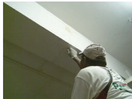
2. Insert injection packers.