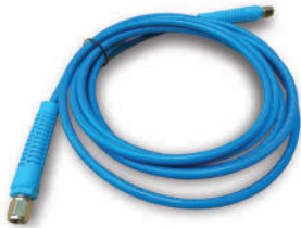
Hose Length: 5M